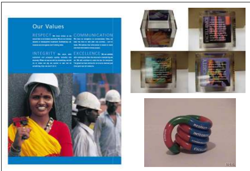
Exhibit 1: A selection of memorabilia to the RICE values

This company's corporate values of 'RICE' were publicised in 1998 and a whole range of merchandise, media and mementos were used to communicate these widely. This company won plaudits for its Brand values and internal communications strategy.