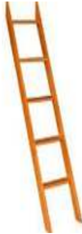
Diagram 1: The idONK 5 level values model